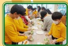
親子小廚師 Little Chef Class