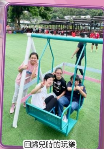
回歸兒時的玩樂 Reliving childhood playfulness