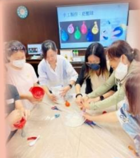
製作舒壓球 Participants made stress balls