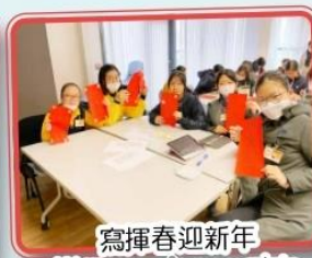
寫揮春迎新年 Writing spring couplets for Chinese New Year