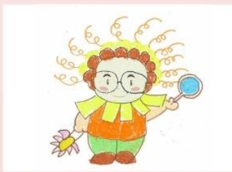
A3 許惺言 奇趣 Boy (好奇心)