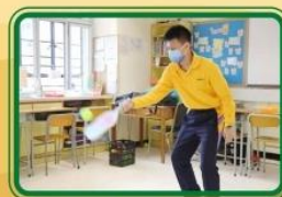
匹克球興趣班 Pickleball Class