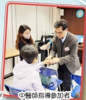
中醫師指導參加者正確穴位 Guiding participants to correctly locate the acupoints