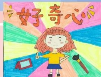
B13 黃允淇 好奇心公主