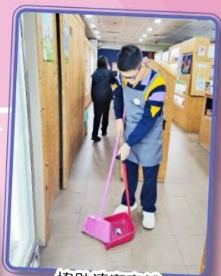
協助清潔店舖 Assisting in store cleaning

The annual alumni association event, "Autumn Outing and BBQ Fun", took place on 11 th November 2023, at Happy Farm. It brought alumni together for a joyful gathering and catching up.