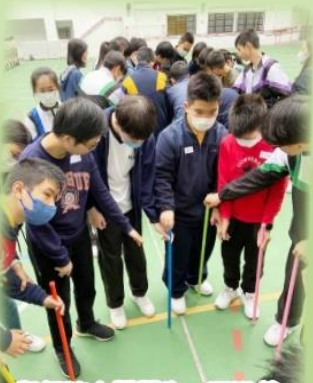
與銀禧中學學生一同遊戲 Engaging in games with Bishop Hall Jubilee School students

The school has had a longstanding collaboration with its sister school, Bishop Hall Jubilee School. On 3 rd February 2024, the "Outdoor Fun Day" was held at Bishop Hall Jubilee School. The atmosphere was lively, and the students thoroughly enjoyed the physical activities designed by the students of Bishop Hall Jubilee School.