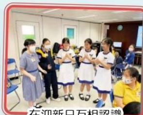
在迎新日互相認識 Getting to know each other on orientation day