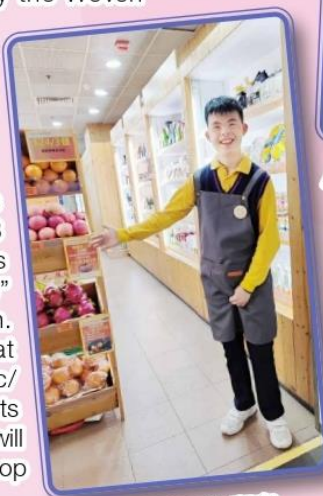
接待到店的顧客 Assisting customers in the store