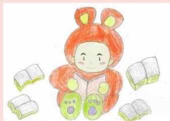
A13 潘俊熹 阿 Bear (喜愛學習)