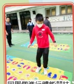
同學們進行體能競技 Participating in physical activities