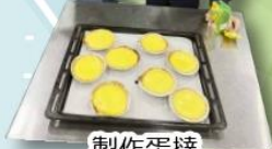
製作蛋撻 Making egg tarts