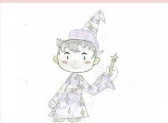
B5 Namsa Magic Learning Wizard (喜愛學習)