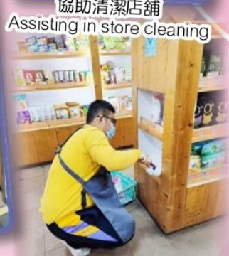
執拾及整理貨架 Organizing and tidying shelves