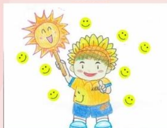
A5 黃弋峰 向陽小子