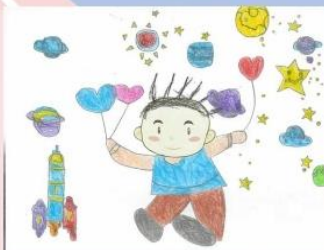
A11 符頌恆 感恩寶寶