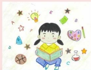
A3 李昕妍 Smart Hazel (喜愛學習)