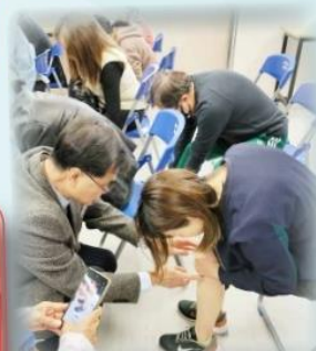
各參加者都很投入地根據中醫師指示按不同的穴位 All participants were actively following the instructions to apply acupressure to different points