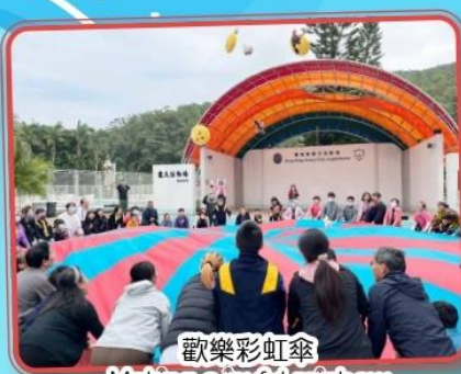
歡樂彩虹傘 Making a joyful rainbow umbrella