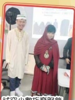
試穿少數族裔服飾 Trying on ethnic minority costumes