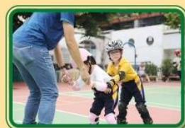
滾軸溜冰體驗班 Roller Skating Class