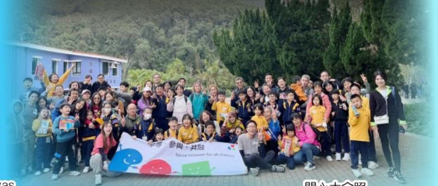
開心大合照 A happy group photo

The "Parent-Child Game Family Camp" day camp held at Tai Tong Holiday Camp was successfully completed on 26 th February 2024. Several dozen families attended the camp, and the response was enthusiastic. The activities were diverse, including crafts and various group games, creating a joyful atmosphere throughout the day.