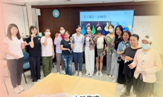
大功告成 The workshop ended with great success