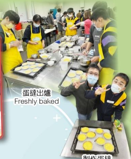
蛋撻出爐 Freshly baked