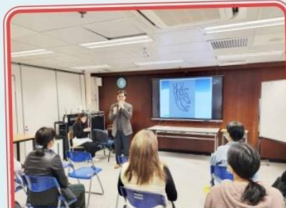
註冊中醫師講解不同穴位及按穴的好處 The registered Chinese medicine practitioner explained different acupoints and the benefits of acupressure

On 17 th January 2024, the Social Work Team invited a registered Chinese medicine practitioner to conduct a parent seminar on "Acupressure Health Treatment". The parents responded enthusiastically and made efforts to learn about acupressure knowledge.