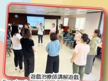
遊戲治療師講解遊戲 The play therapist explained various games