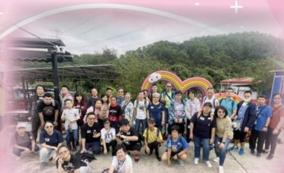
難得一聚，來個大合照 Capturing precious moments with a group photo