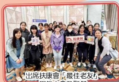
出席扶康會「最佳老友」周年大會及聚餐 Attending the anniversary meeting and dinner of the Fu Hong Society "Best Friends" program

The school collaborated with Diocesan Girls' School once again this academic year to organize multiple "Best Friends" events. During these events, students from both schools got to know each other and formed precious friendships, fostering a culture of inclusivity on campus.