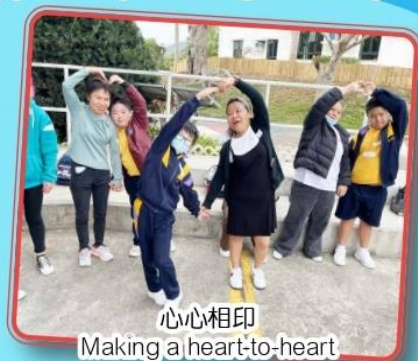
心心相印 Making a heart-to-heart connection