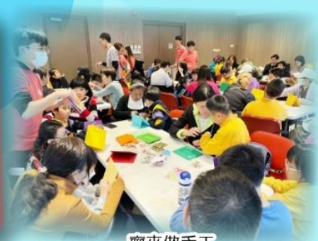
齊來做手工 Engaging in crafts