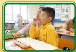
珠心算初階班 Mental Abacus