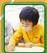
珠心算進階班 Advanced Mental Abacus Class