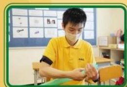
親子正向趣味扭氣球課程 Ballon Twisting Course