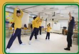
校園健康舞 Campus Aerobics