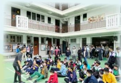
活動後互相分享交流 Sharing and exchanging experiences after activities