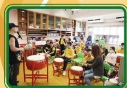
中國鼓班 Chinese Drum Class