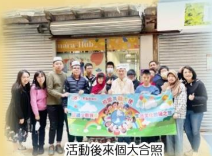
活動後來個大合照 Group photo after the activity

The Social Work Team and Non-Chinese Language Team jointly organized the "Cultural Experience Activity for Ethnic Minorities" on 6 th January 2024. Over ten students served as campus integration ambassadors of our school. Through visiting ethnic minority communities, students gained a better understanding of their daily lives and promoted a spirit of integration.