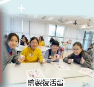
繪製復活蛋 Decorating Easter eggs