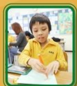
社交遊戲小組 Social Group