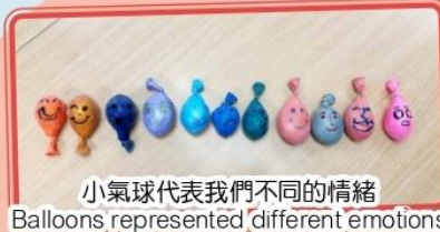
小氣球代表我們不同的情緒 Balloons represented different emotions

On 17 th April 2024, the Social Work Team invited a play therapist to conduct a parent workshop on "Building Quality Parent-Child Relationships through Games". Parents learned how to enhance their relationship with their children through games, thus establishing a high-quality parent-child bond.