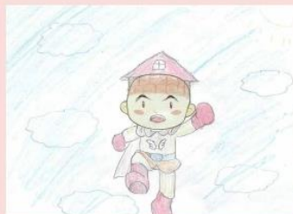
A14 卓家羽 樂觀超人阿家 (樂觀)