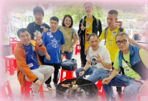
一同享受燒烤樂 Enjoying BBQ together