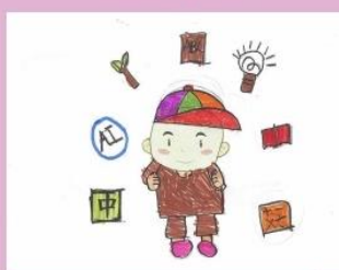
B14 李珽軒 小智 (喜愛學習)