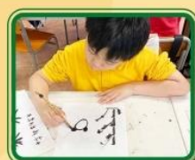
簡易水墨畫班 Chinese Ink Painting Class