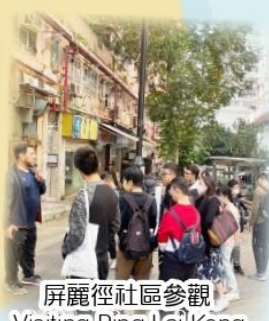
屏麗徑社區參觀 Visiting Ping Lai Keng Community