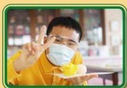
黏土畫 Clay Art Class