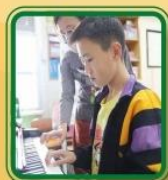
鋼琴進階班 Advanced Piano Class