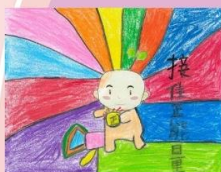
B11 麥煒正 正正 (樂觀)